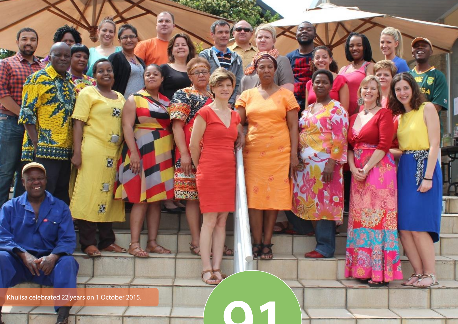
Khulisa celebrated 22 years on 1 October 2015.